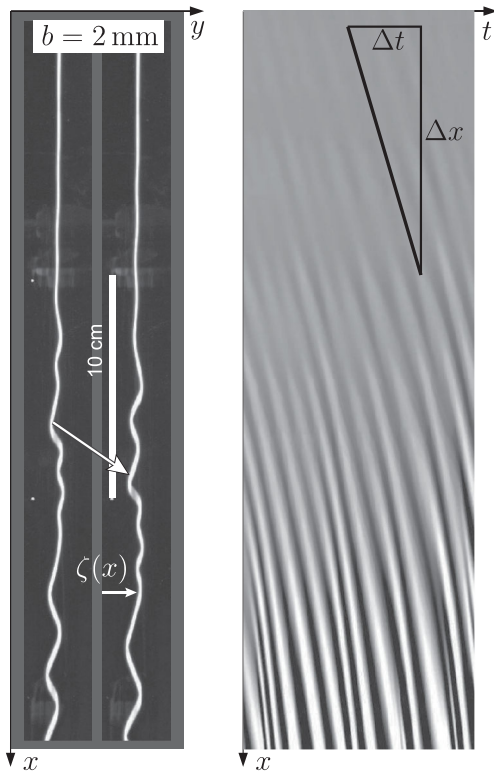
FIG. 2. Left: Two successive images of meandering patterns (system A, Q = 182 \text{ mm}^3/\text{s} ), with \Delta t = 0.33 \text{ s} between them. The spatial shift, indicated by an arrow, shows the phase speed u_\phi = 2.42 \text{ cm/s} . Note the irregularity of the pattern. Right: A spatiotemporal plot [same spatial scale, gray value proportional to \zeta(x, t) ]; the triangle indicates the measurement of u_\phi in the linear regime.

At low flow rates, the rivulet remains perfectly straight over the whole length of the Hele-Shaw cell. Moreover, its width stays constant over the whole length of the cell, indicating that the flow is fully developed from near the inlet, and the mean flow speed is determined by a balance of gravity and viscous friction. Above a critical flow rate